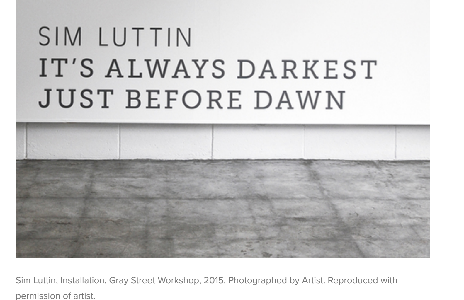
There is still time to catch the show at Gray Street this weekend. It is a must if you are in Adelaide.