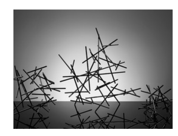
Large Interlace Sculpure A YEAR AGO